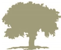
Chapman Center for Rural Studies

KANSAS STATE UNIVERSITY | College of Arts and Sciences